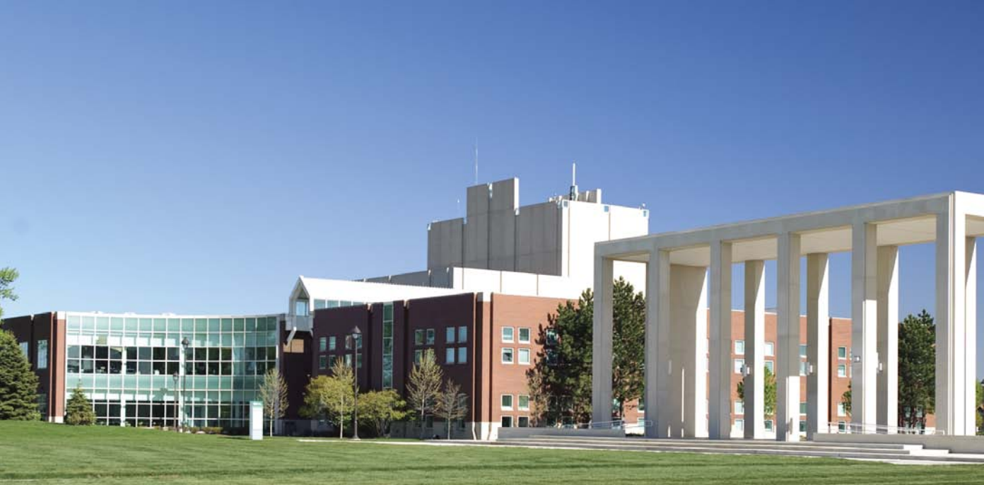
The new Gateway (right) is located next to the Arts Center.

Moraine Valley Community College invites you to our Fine and Performing Arts Center for a season filled with music, dance, theater, and art for all ages. We're pleased to bring you another outstanding lineup of concerts and special events in our 600-seat Dorothy Menker Theater, our intimate John and Angeline Oremus Theater, and our Robert F. DeCaprio Art Gallery. Join us!